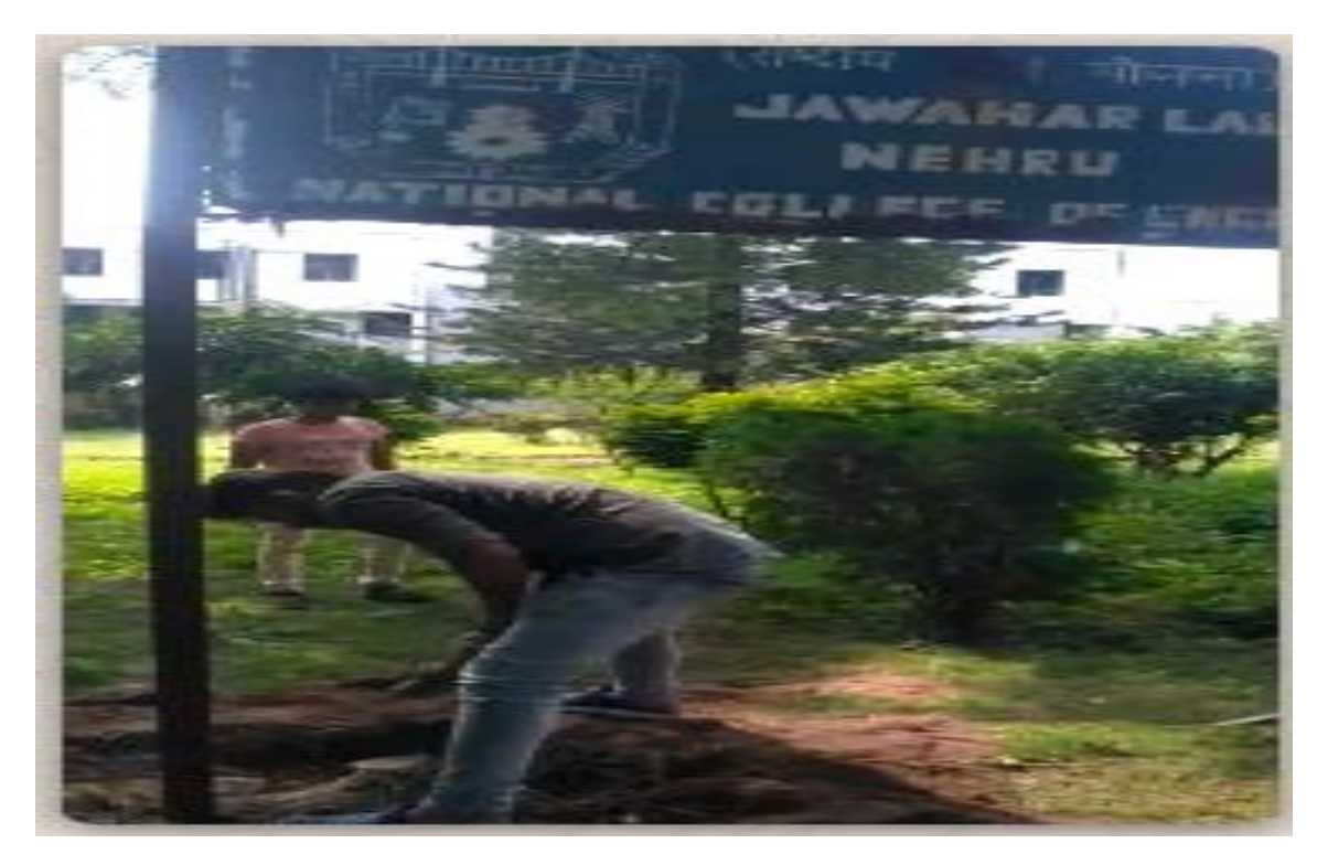
Campus clean-up activity dated 19/10/2019.