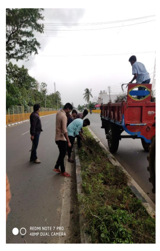
Campus clean up activity dated 09/11/2019