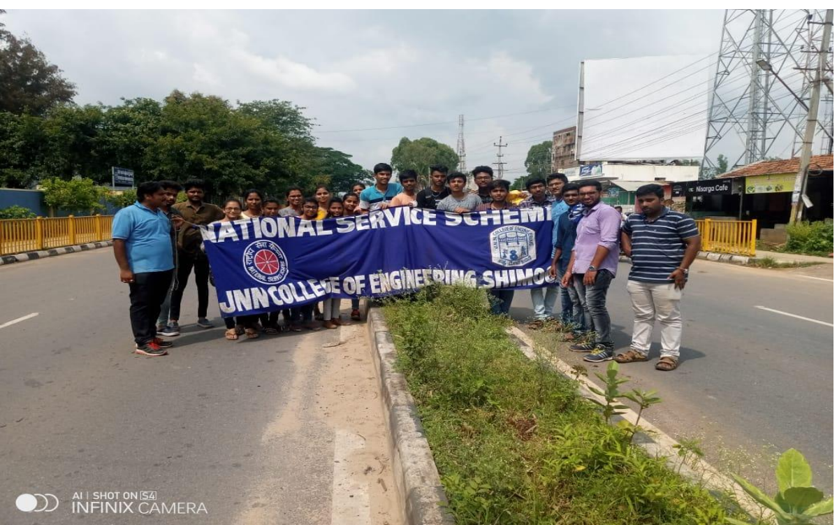
Sowing of Karaveera-seeds along the divider of Sowlanga road from MBA college gate till DSDN gate. (1 kilometre stretch). NSS regular activity dated 12/10/2019.