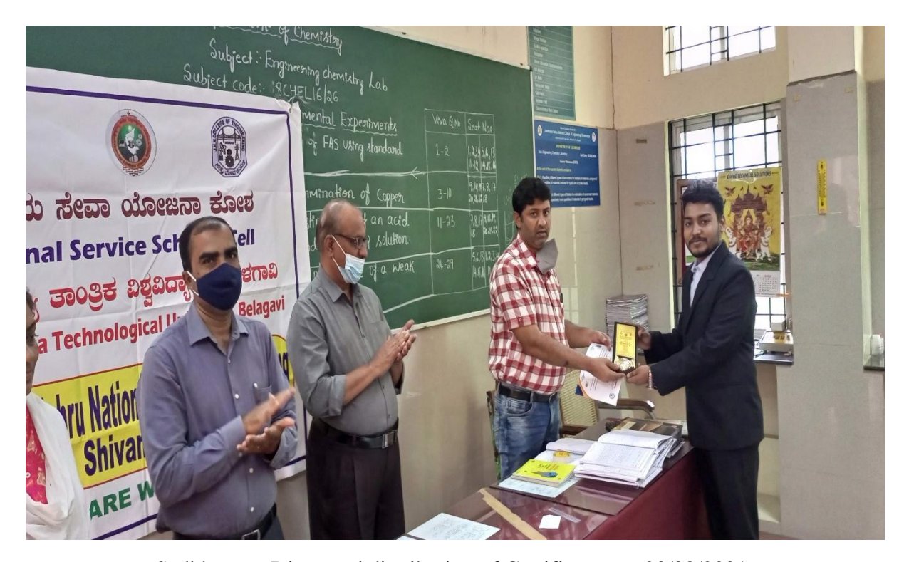
Sadbhavana Divas and distribution of Certificates on 23/08/2021.