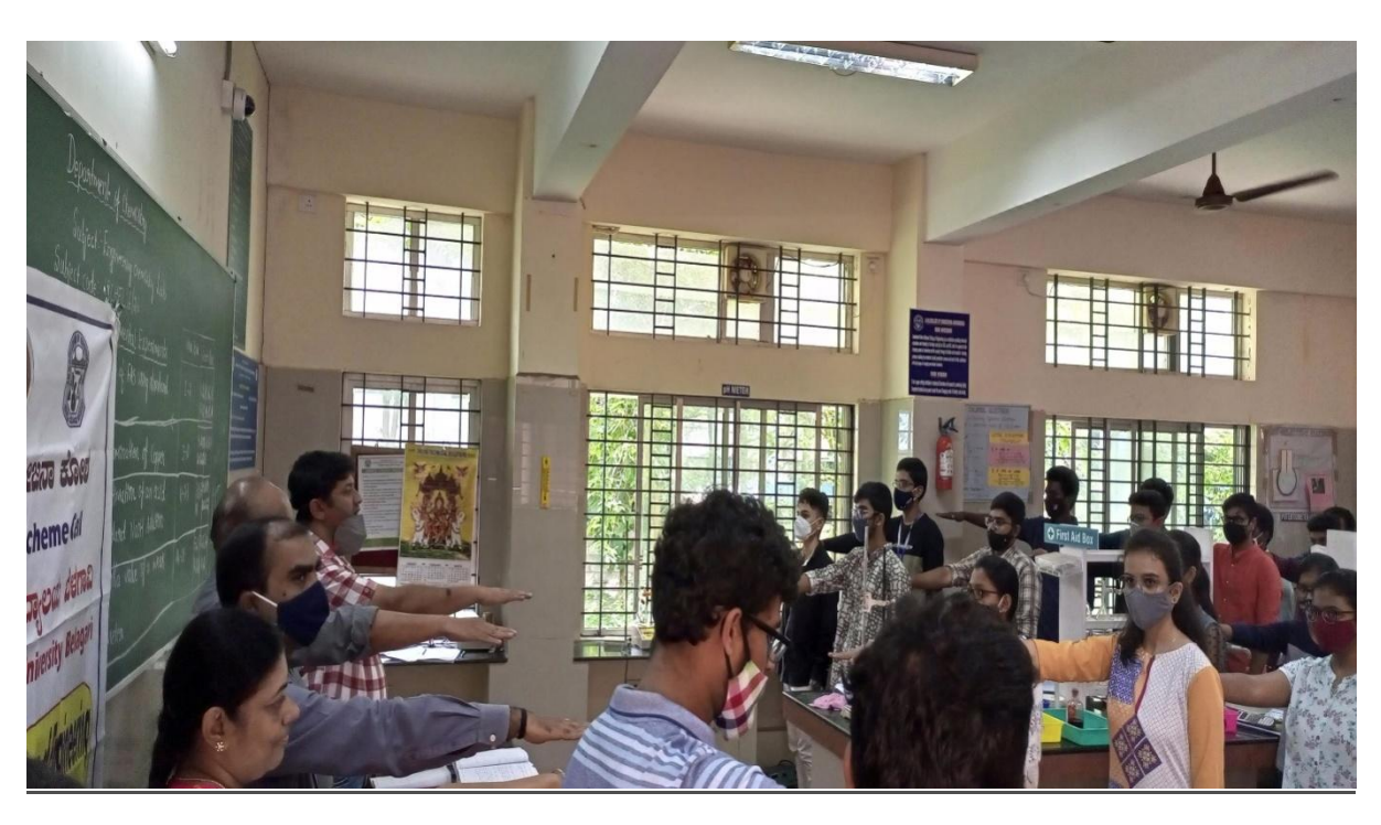
Sadbhavana Divas and distribution of Certificates on 23/08/2021.