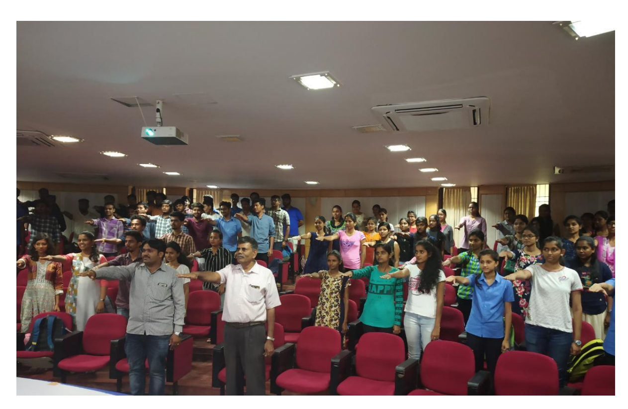
Observation of "Rashtriya Ekta Divas," on 31/10/2020.