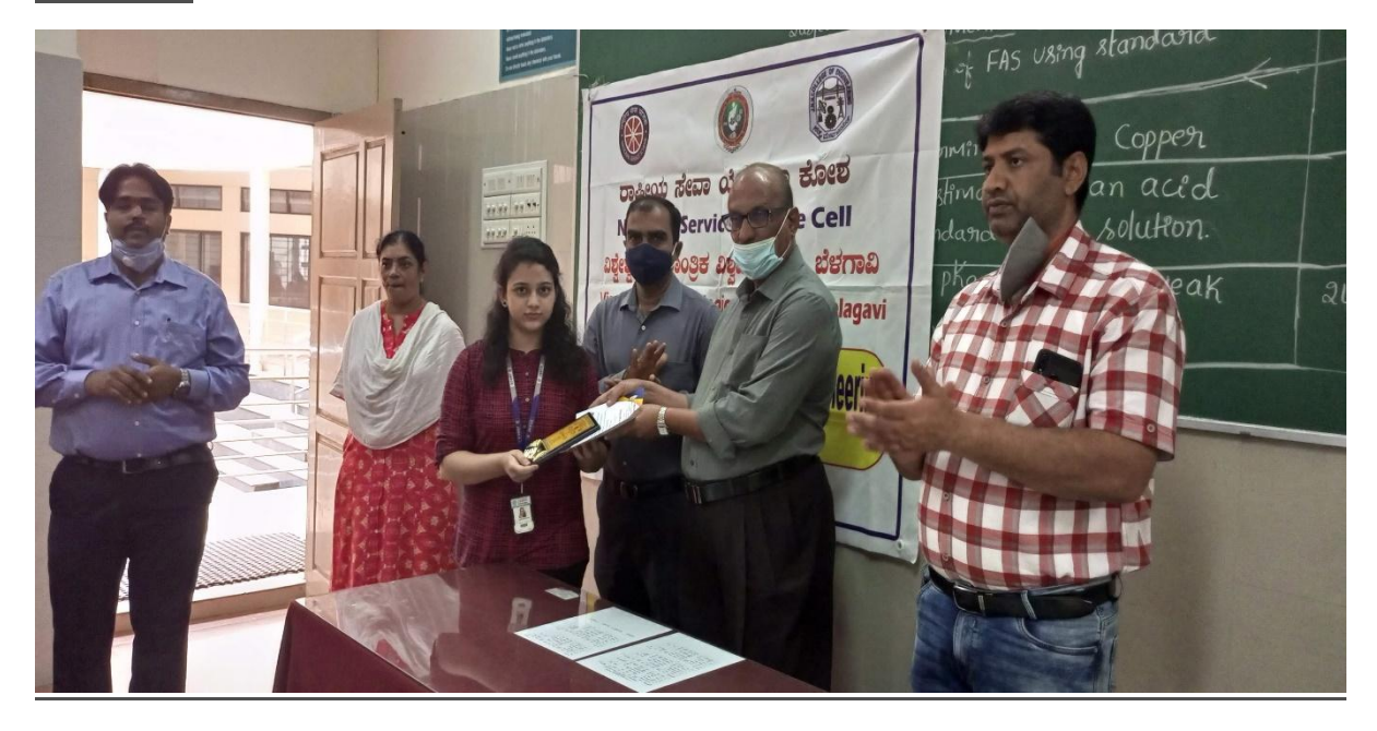
Sadbhavana Divas and distribution of Certificates on 23/08/2021.