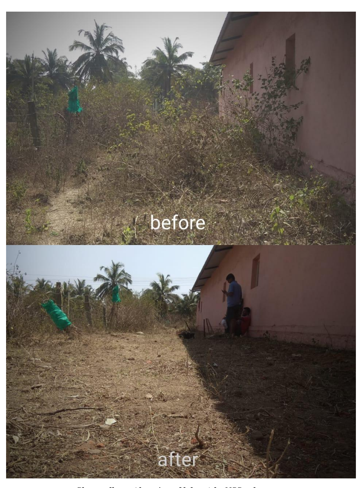
Shramadhaan (donation of labour) by NSS volunteers.