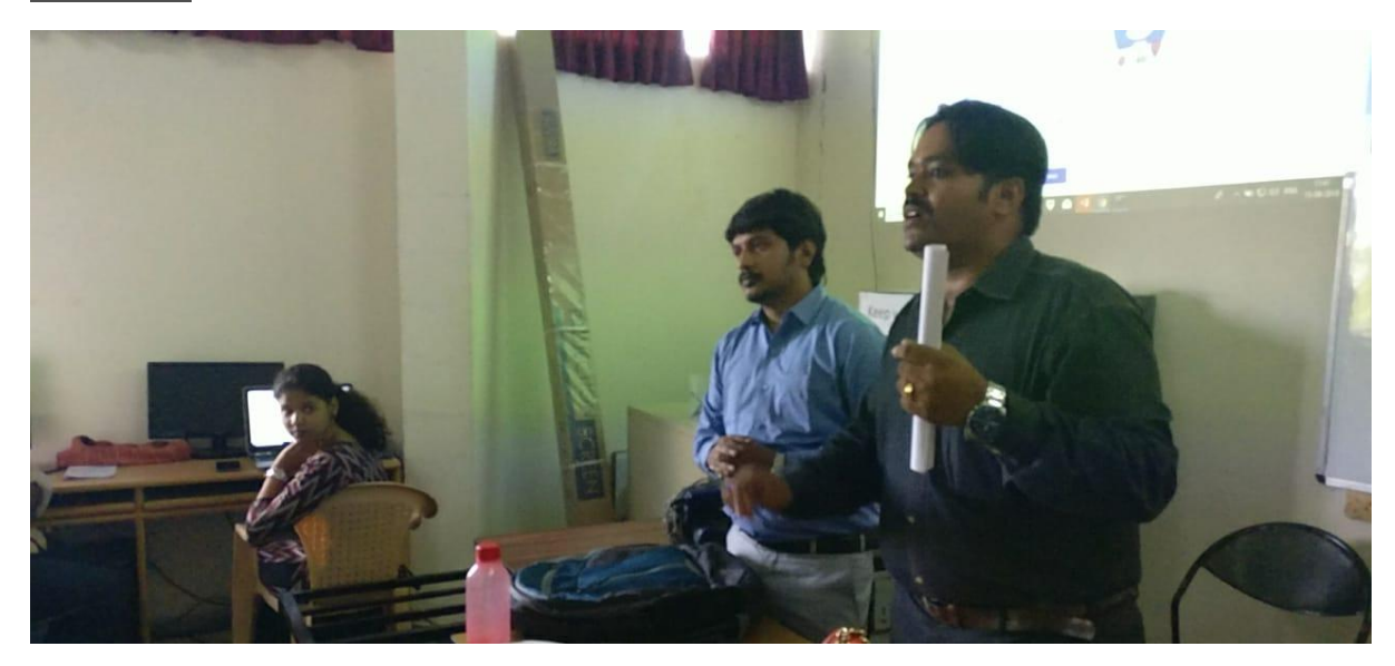
Observation of "Sadbhavana Divas" on 20/08/2020.