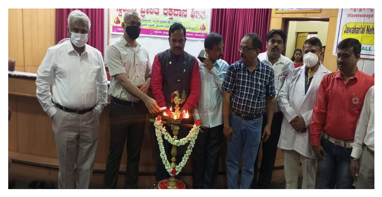
Mega Blood Donation and Health Check-up camp held on 12/01/2022.