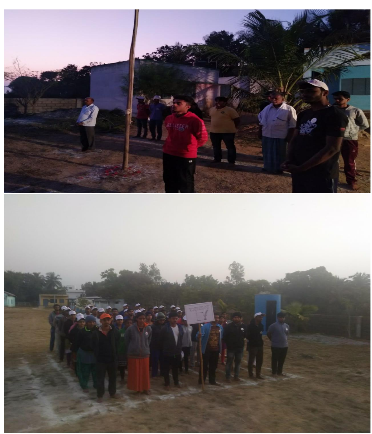
NSS FLAG HOISTING.