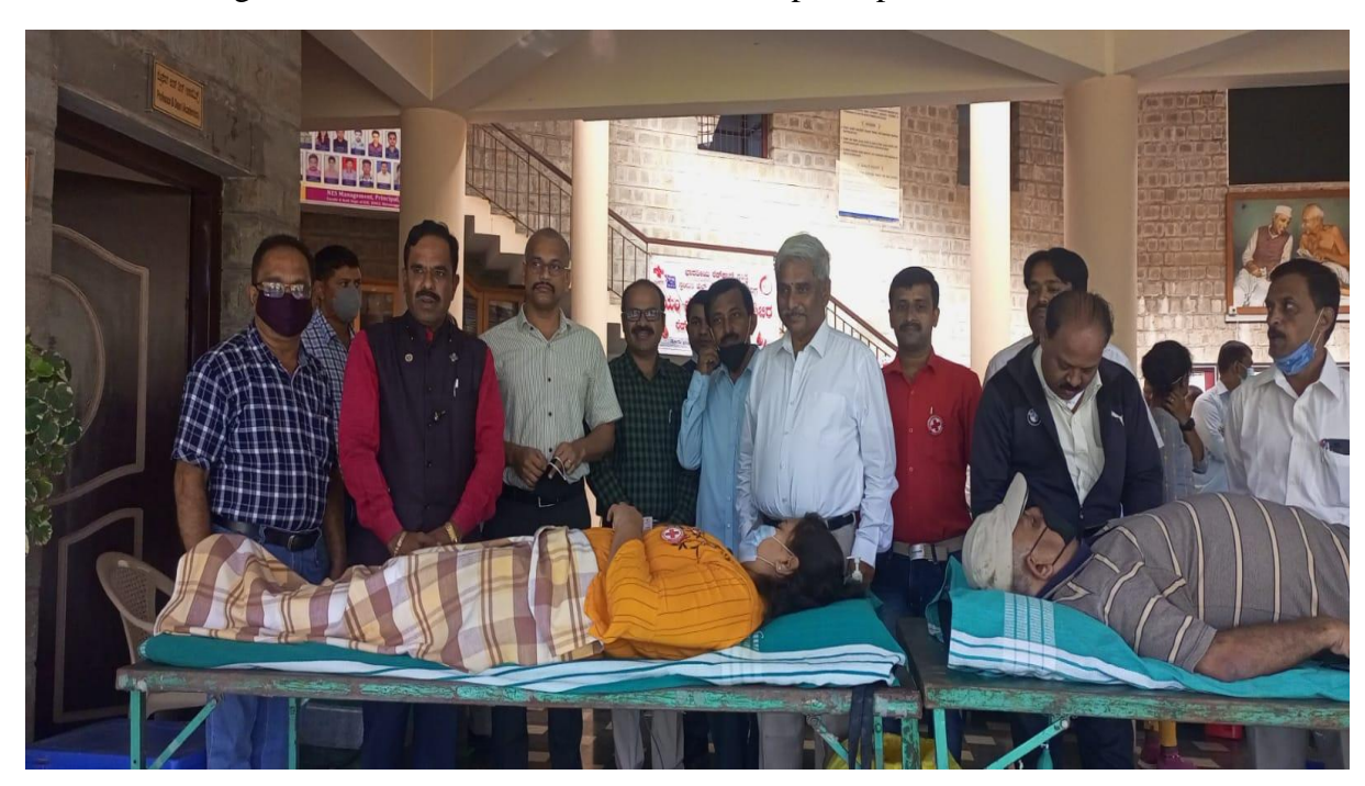
Mega Blood Donation and Health Check-up camp held on 12/01/2022.