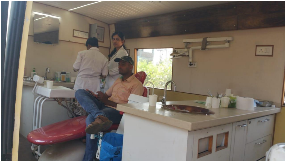
Health check-up camp by Subbiah institute of medical sciences.