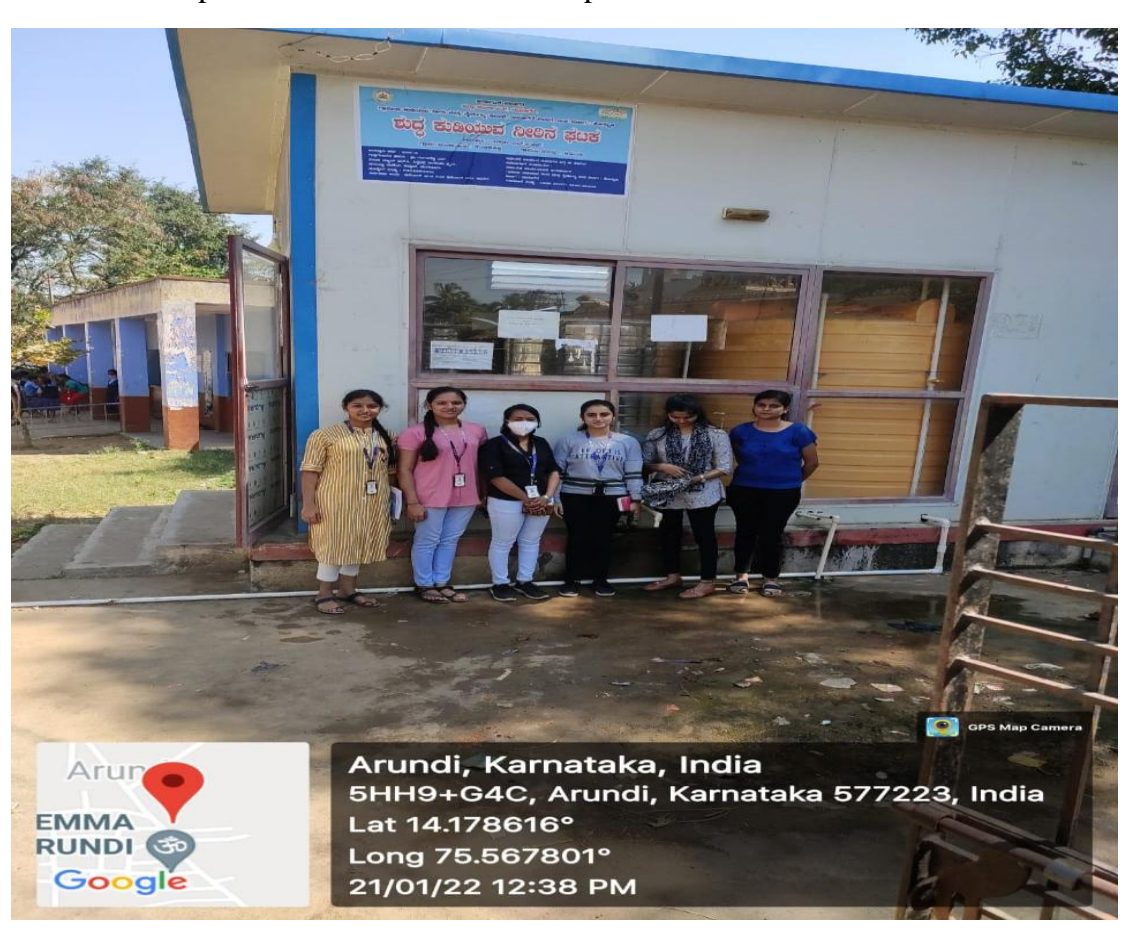
Inspection and evaluation of RO plants-Phase 3 on 21/01/2022