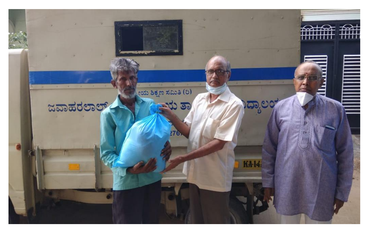
Distribution of Food kits by NES office bearers. On 19/04/2021.