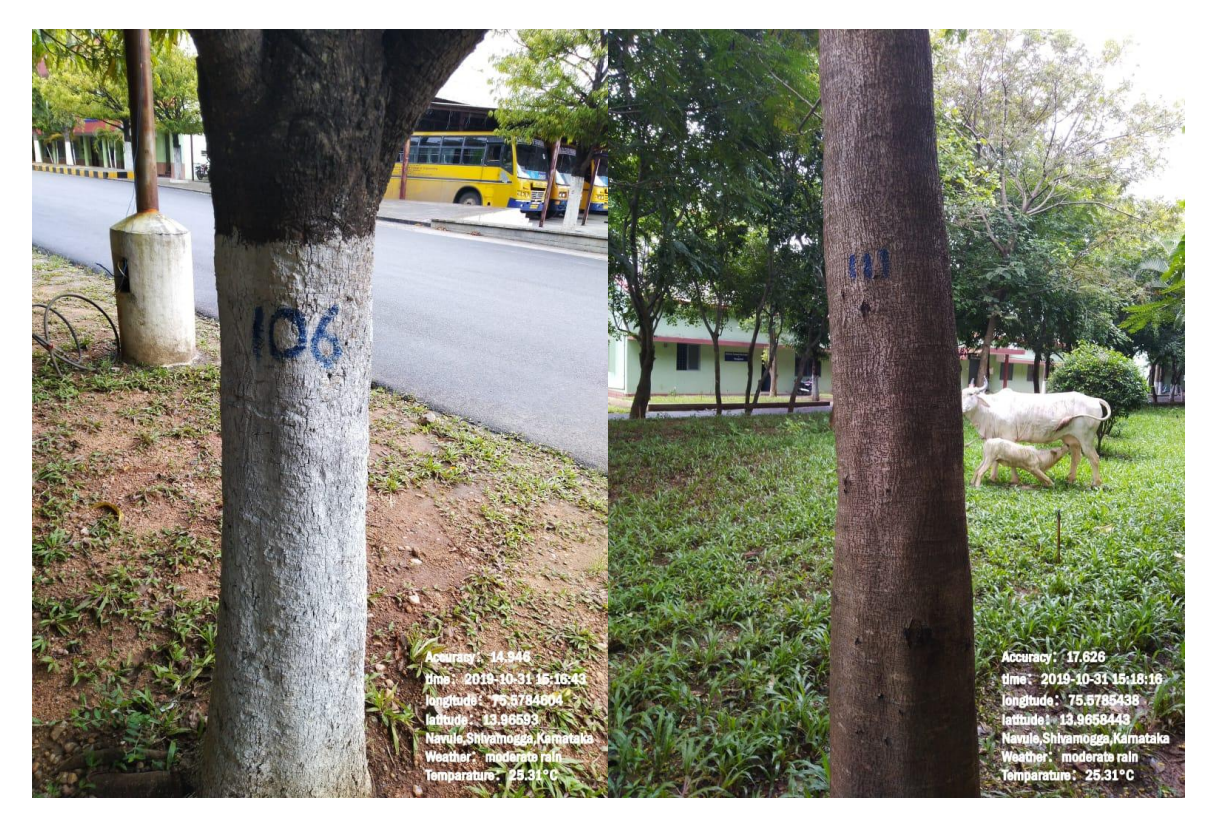
Geo-stamping\ of\ trees\ of\ JNNCE\ campus\ phase\ 1dated\ 09/11/2019.