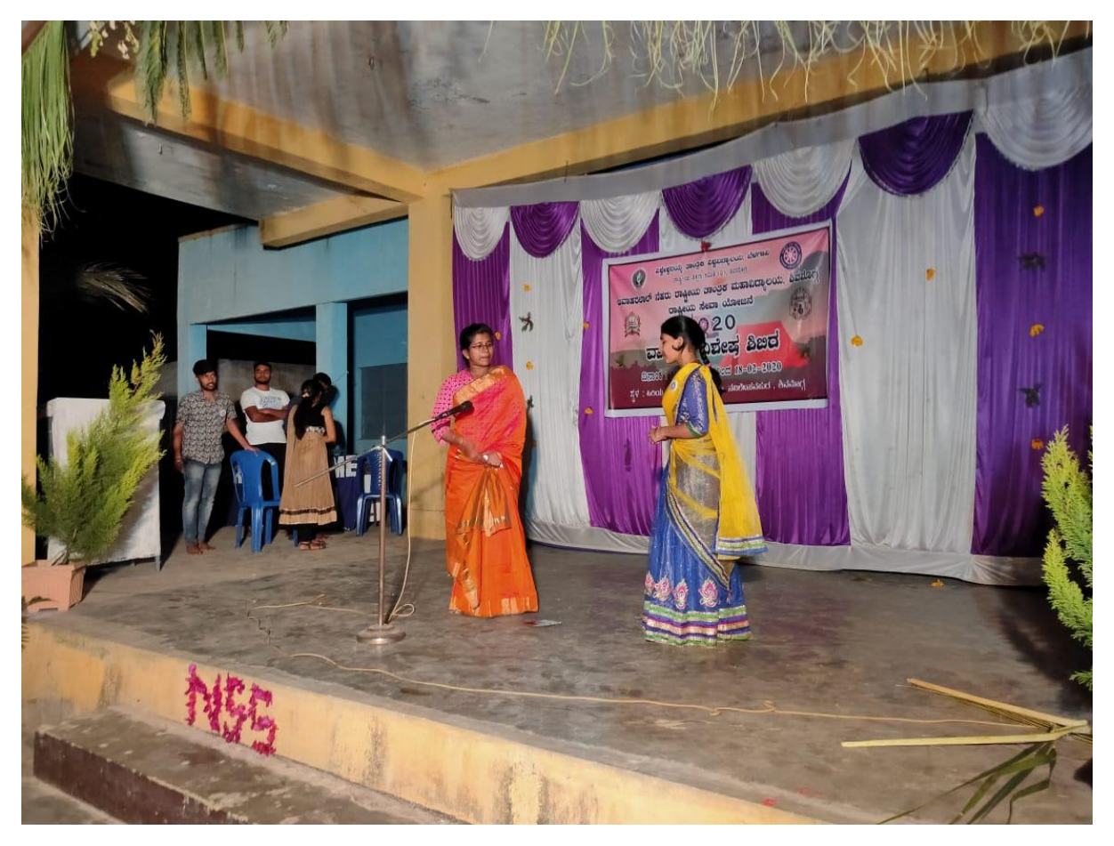
Cultural activites at NSS annual camp 2020.

NSS annual camp-2020 from 11/02/2020 to 18/02/2020