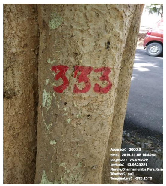
Geo-stamping of trees of JNNCE campus phase 2 dated 23/11/2019