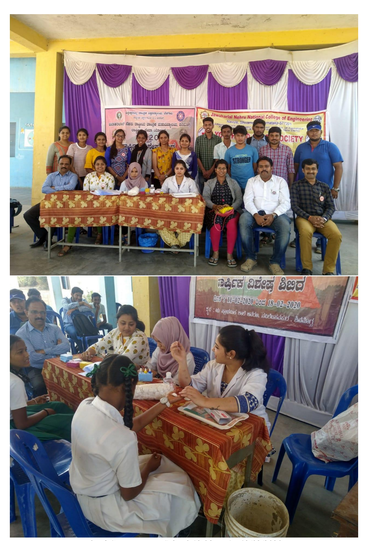
Blood Grouping For School Children On 12/02/2020.