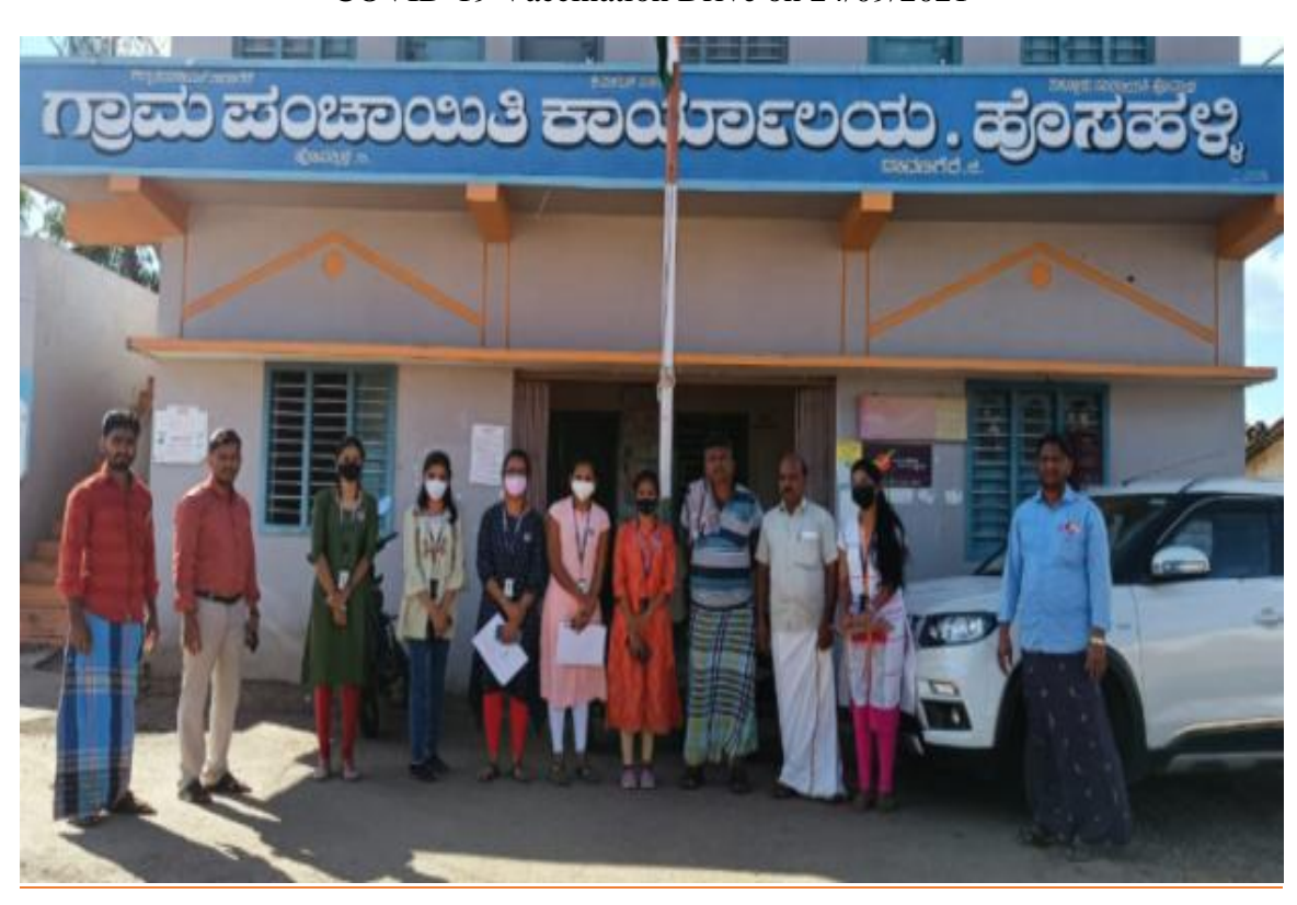
Inspection and evaluation of RO plants-Phase 1 on 28/12/2021.